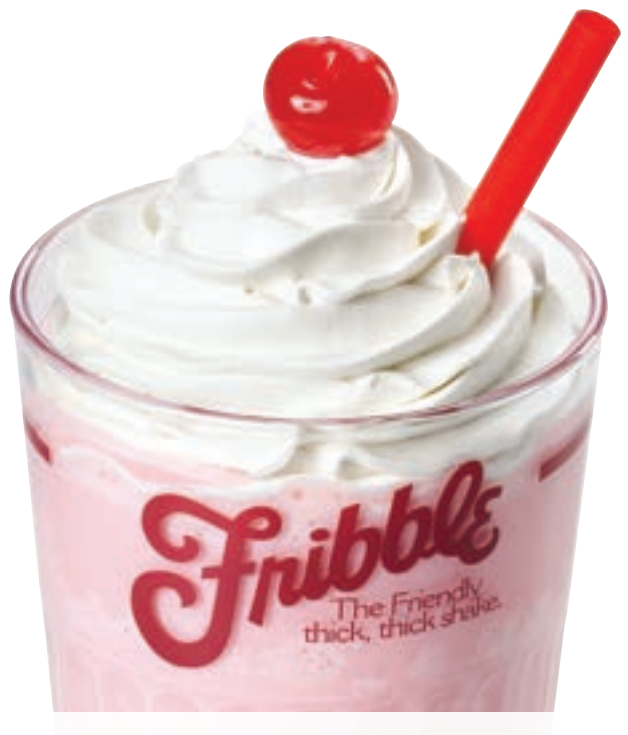
FRIBBLE® YOU JUST CAN'T LEAVE WITHOUT ONE

100% Arabica Coffee Fresh Brewed Hot Coffee I Regular or Decaf Hot Chocolate or Hot Tea