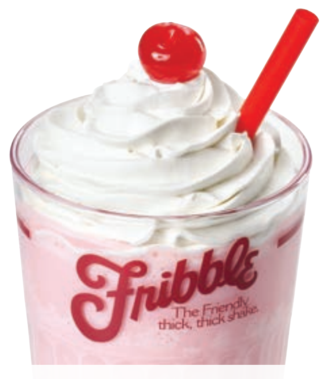
FRIBBLE® YOU JUST CAN'T LEAVE WITHOUT ONE!

100% Arabica Coffee Fresh Brewed Hot Coffee I Regular or Decaf Hot Chocolate or Hot Tea