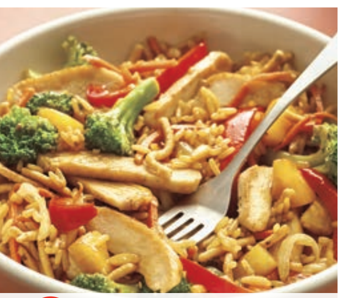
NEW ALOHA STIR FRY CHICKEN