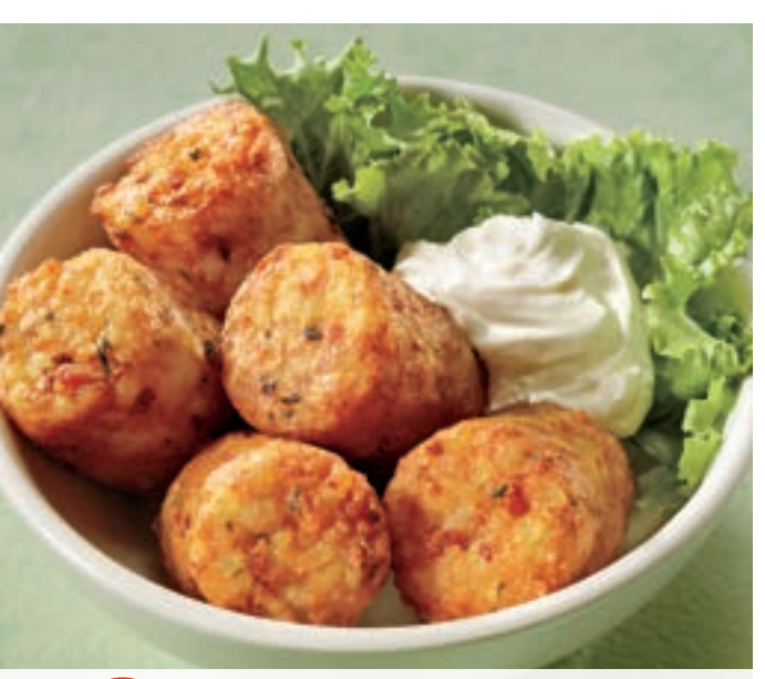
NEW TATER KEGS APPETIZER