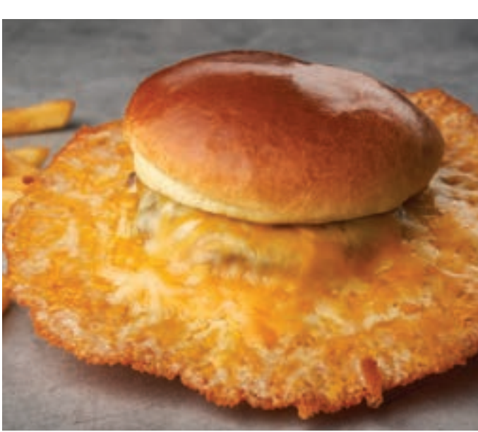
NEW CHEESE SKIRT BURGER