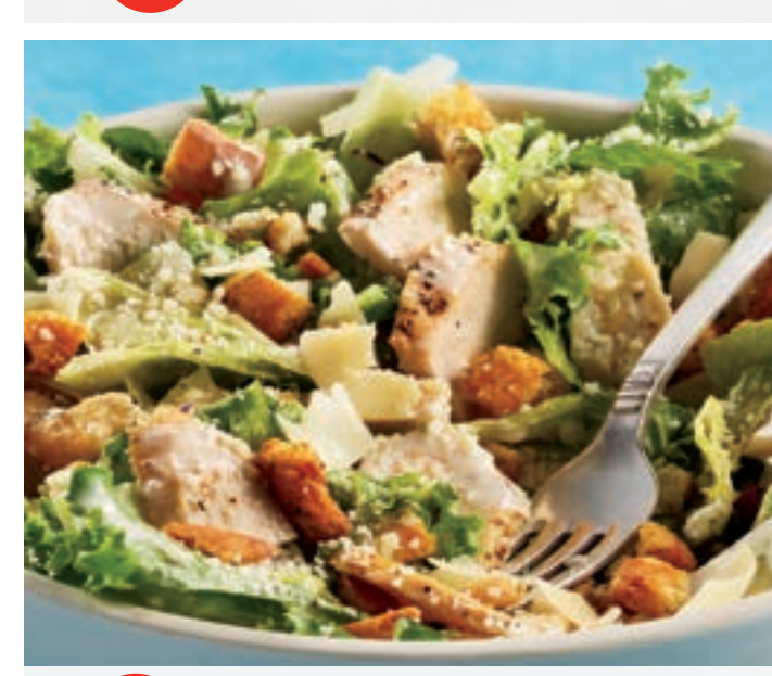
NEW CHICKEN CAESAR SALAD