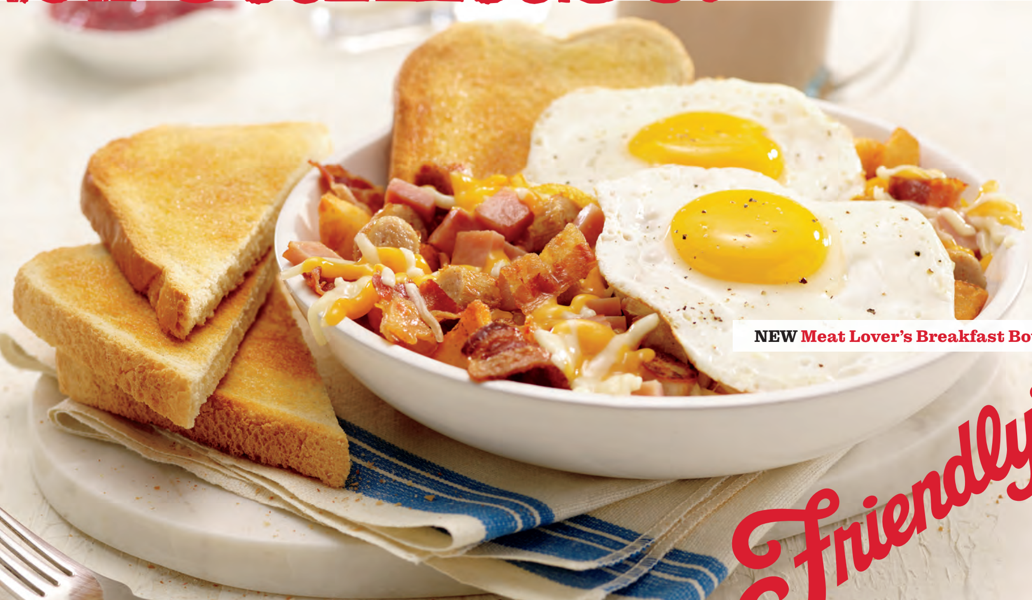
NEW Meat Lover's Breakfast Bowl