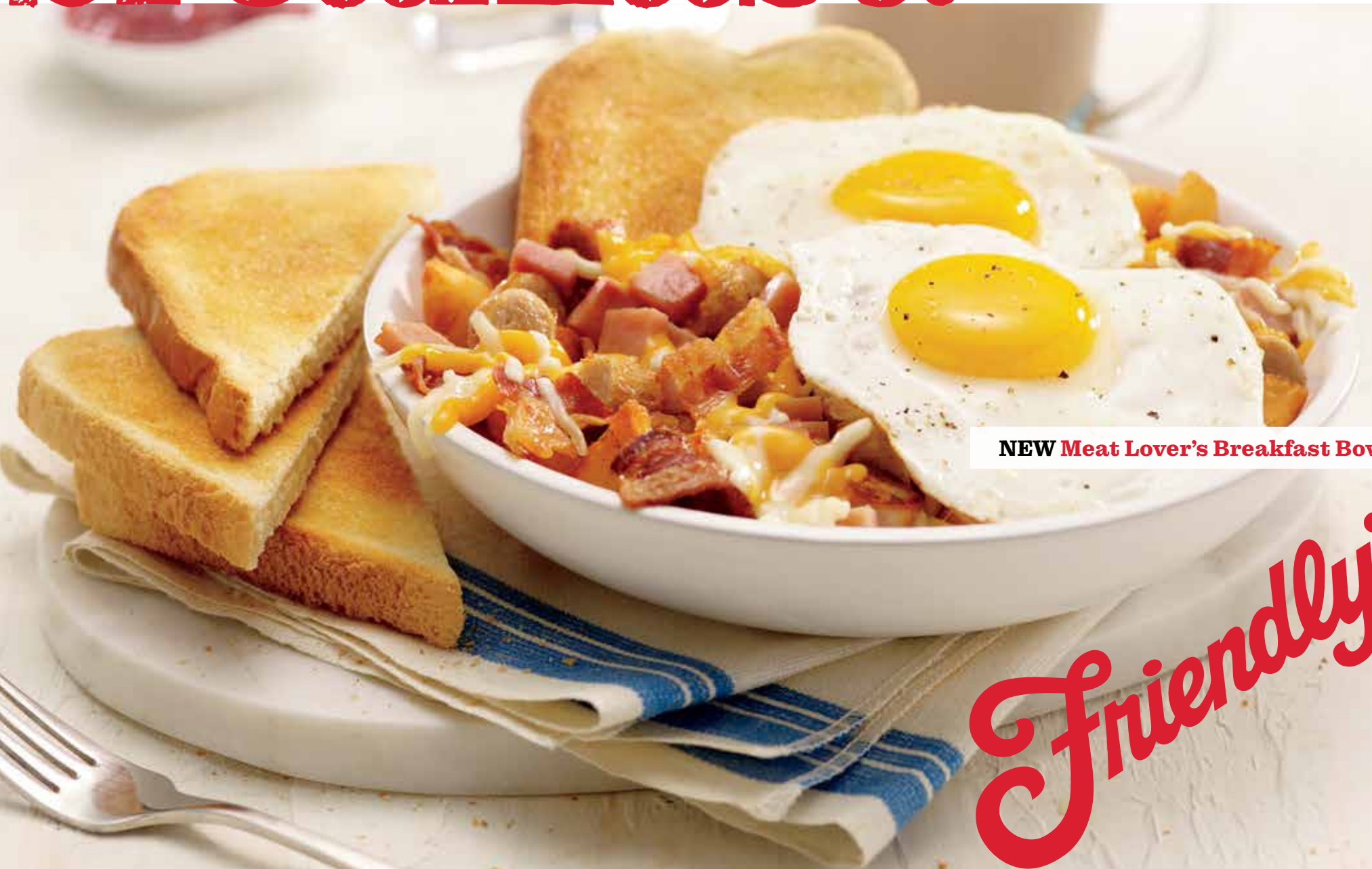
NEW Meat Lover's Breakfast Bowl