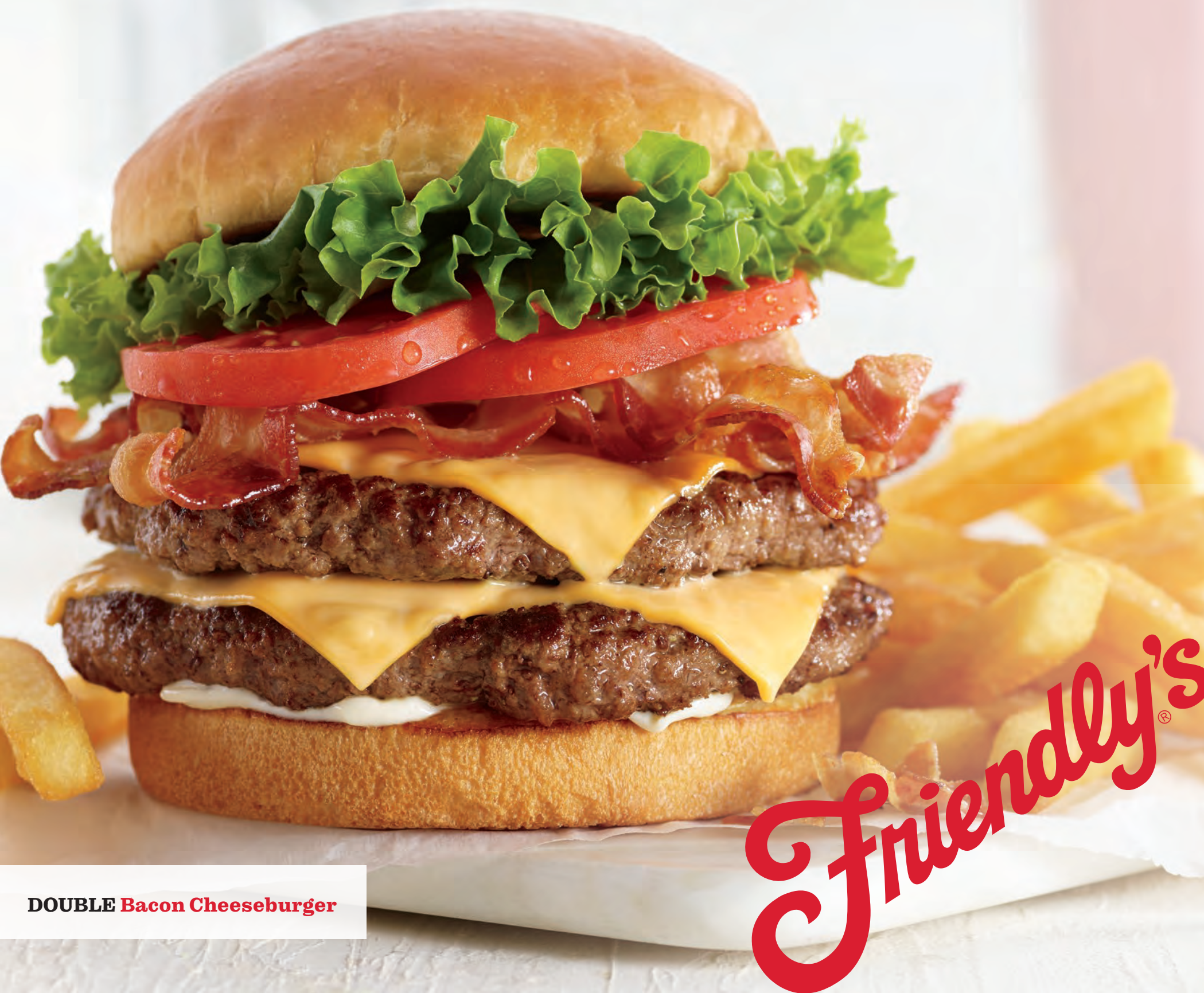
DOUBLE Bacon Cheeseburger