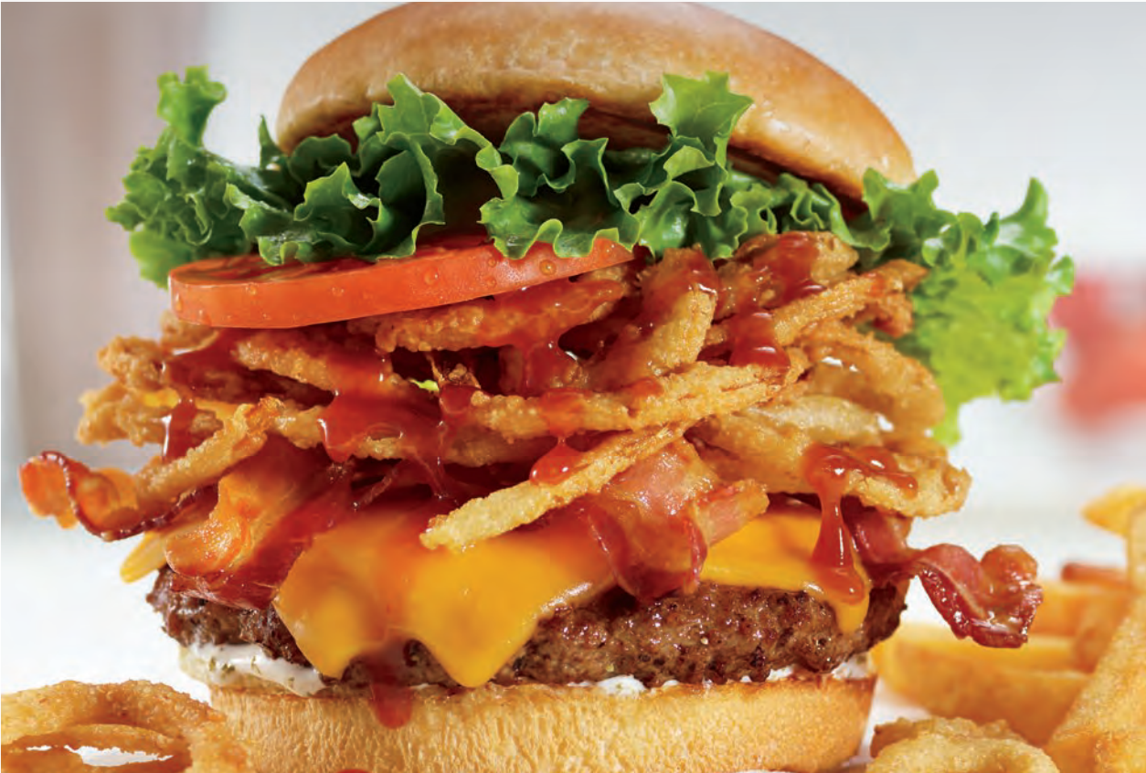
Honey BBQ Burger

Before placing your order, please inform your server if a person in your party has a food allergy.†Consuming raw or undercooked meats, poultry, seafood or eggs may increase your risk of foodborne illness, especially if you have certain medical conditions. All Friendly’s burgers are cooked to at least 160.°