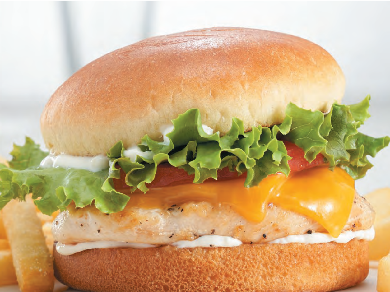
Grilled Chicken Sandwich

Friendly’s BLT 8.99 EVERY DAY VALUE Irresistible strips of applewood-smoked bacon, fresh lettuce, tomato and a dollop of mayo on toasted sourdough bread. (810 Calories)