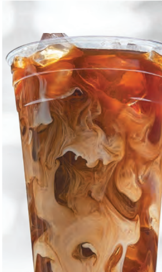
NEW Iced Coffee