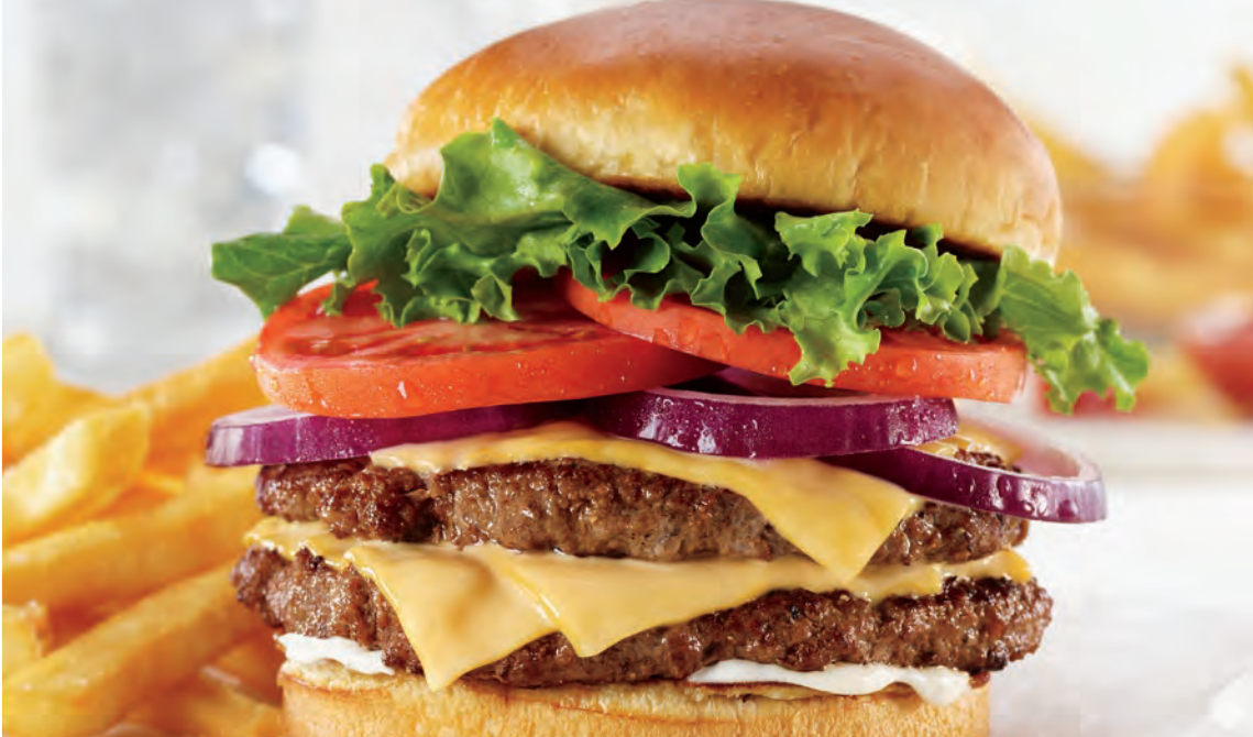
DOUBLE All-American Cheeseburger

Sweet, sweet bliss when you bite into two 4.75 oz. burger patties topped with our signature honey BBQ sauce, melted Cheddar cheese, crispy fried onion strings, applewood-smoked bacon, fresh lettuce, tomato and Ranch dressing on a soft Brioche bun. (1760 Calories)