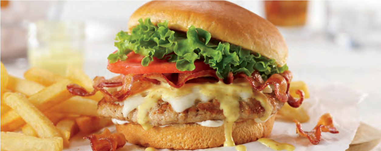
Bacon & Swiss Turkey Burger