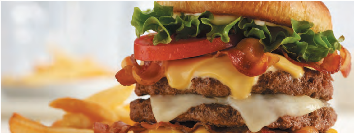
NEW Triple Decker Bacon Cheeseburger