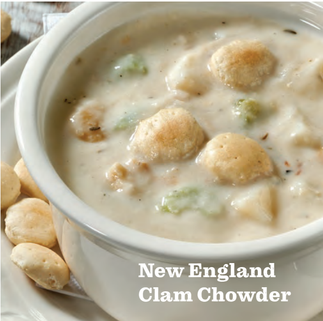
New England Clam Chowder