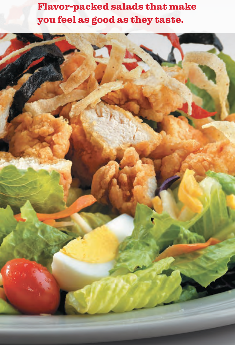
Signature Chicken Entree Salad