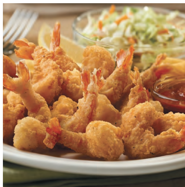
Fried Shrimp Platter