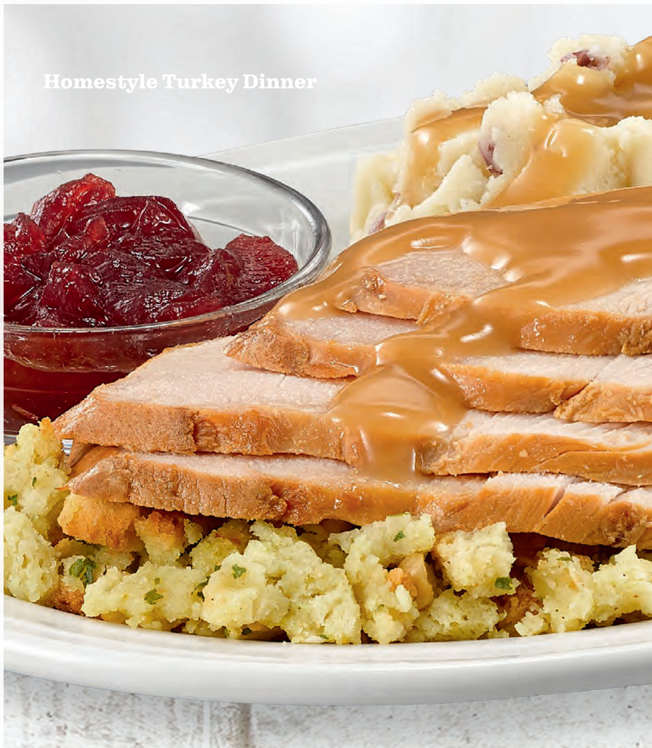
Homestyle Turkey Dinner

Flaky tavern-battered premium cod fillets served with golden fries, coleslaw, a lemon wedge and tartar sauce. (1300 Calories)