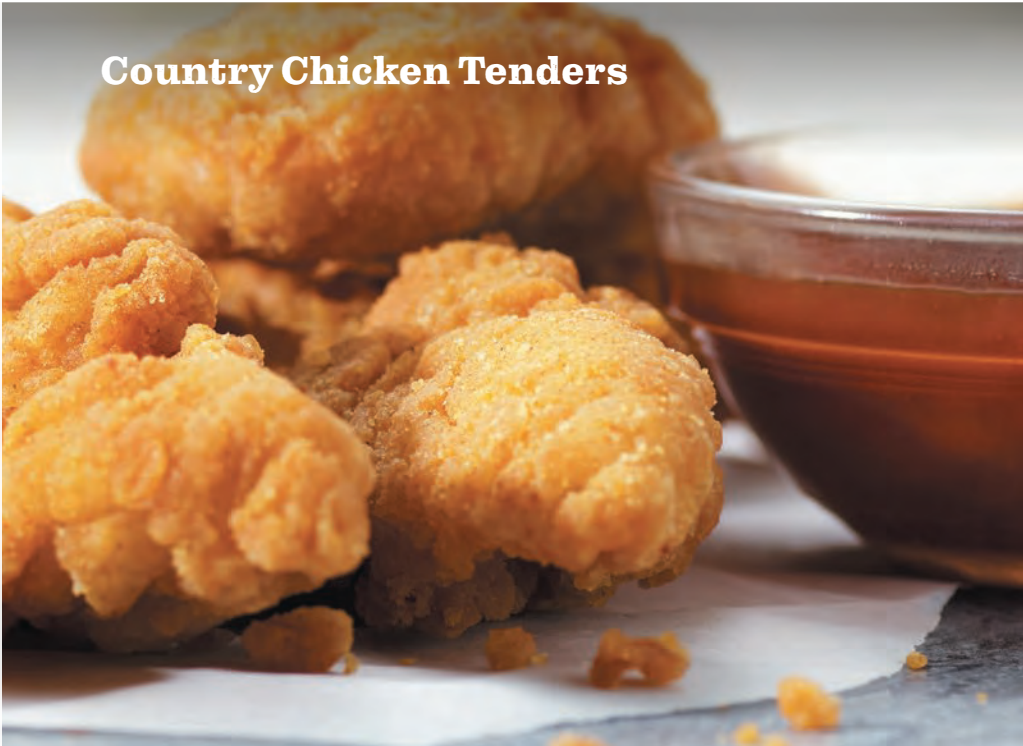
Country Chicken Tenders

Before placing your order, please inform your server if a person in your party has a food allergy. †Consuming raw or undercooked meats, poultry, seafood or eggs may increase your risk of foodborne illness, especially if you have certain medical conditions. All Friendly’s burgers are cooked to at least 160.°