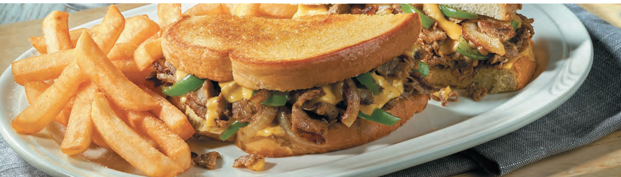
Philly Steak & Cheese SuperMelt

It's our commitment to mixing & melting fun flavors to make your Friendly's favorites the best part of your day.