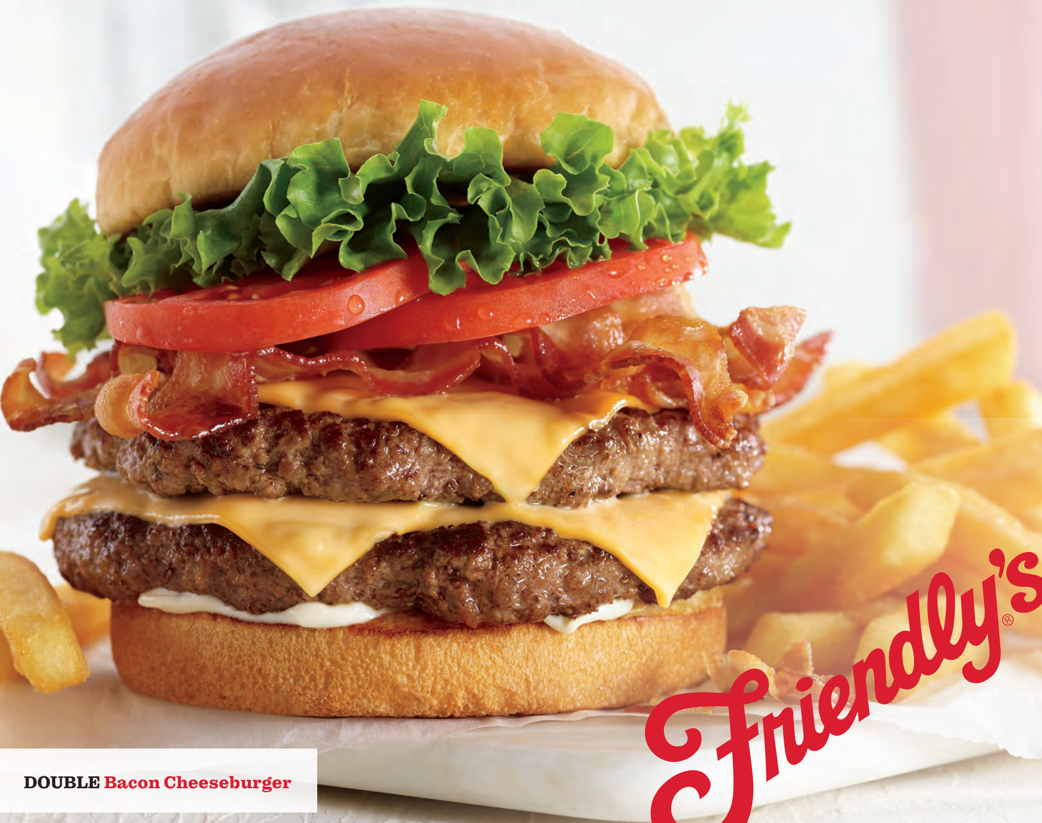
DOUBLE Bacon Cheeseburger