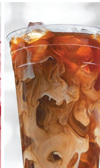
NEW Iced Coffee