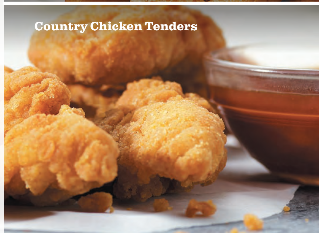
Country Chicken Tenders

Before placing your order, please inform your server if a person in your party has a food allergy. †Consuming raw or undercooked meats, poultry, seafood or eggs may increase your risk of foodborne illness, especially if you have certain medical conditions. All Friendly's burgers are cooked to at least 160.°