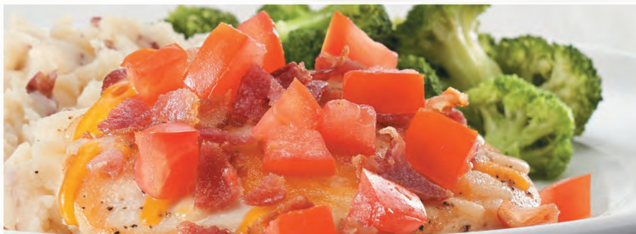
NEW Cheddar Jack Chicken