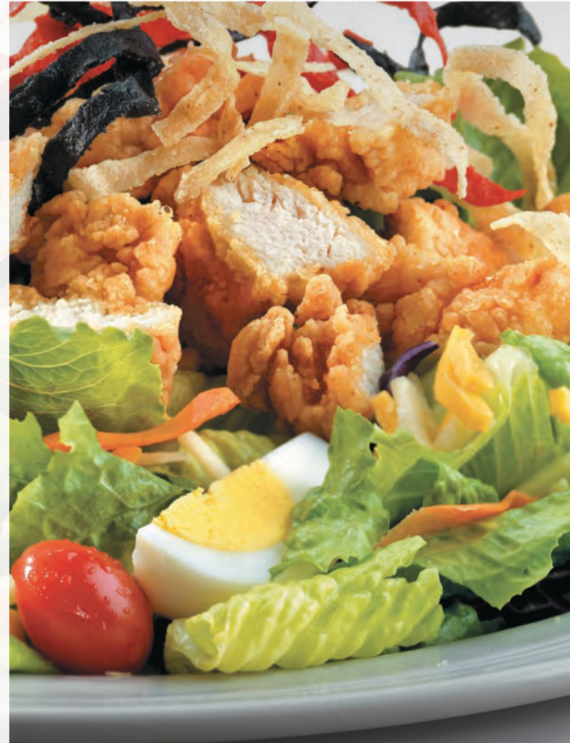
Signature Chicken Entree Salad