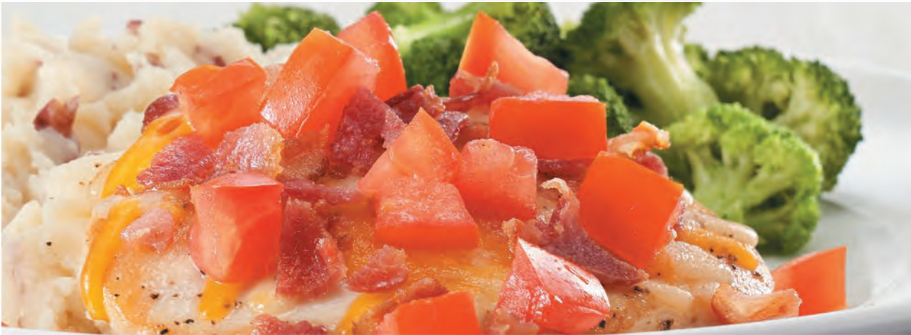
NEW Cheddar Jack Chicken