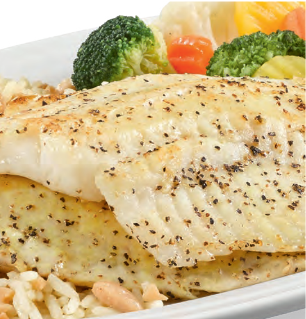
Lemon Pepper Fish Dinner