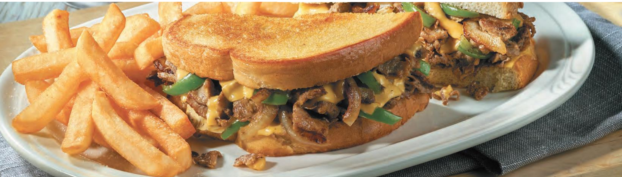
Philly Steak & Cheese SuperMelt

It's our commitment to mixing & melting fun flavors to make your Friendly's favorites the best part of your day.