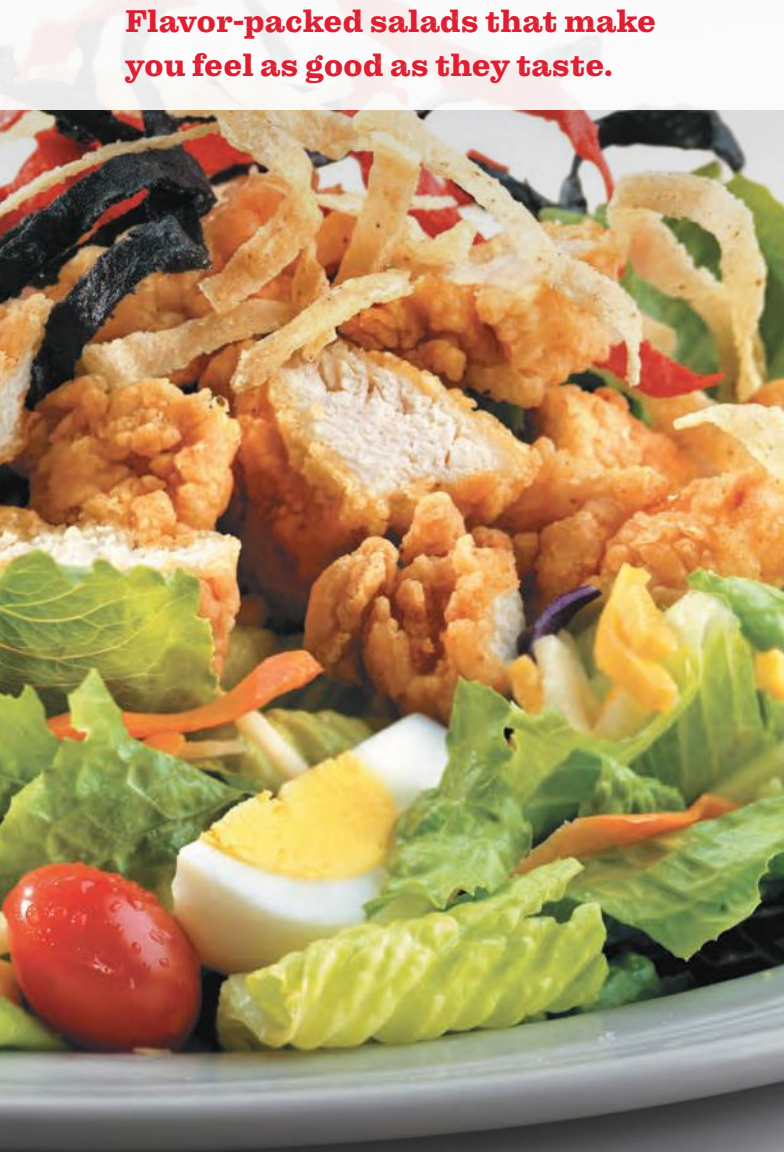
Signature Chicken Entree Salad