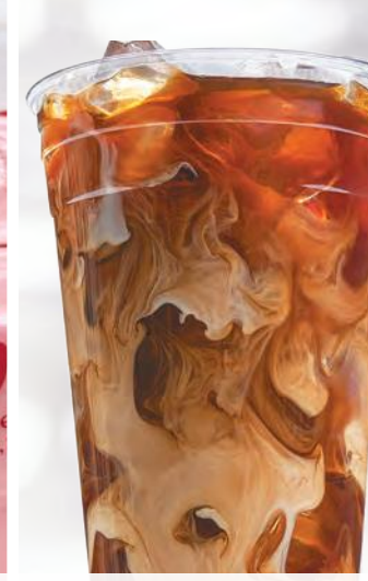
NEW Iced Coffee