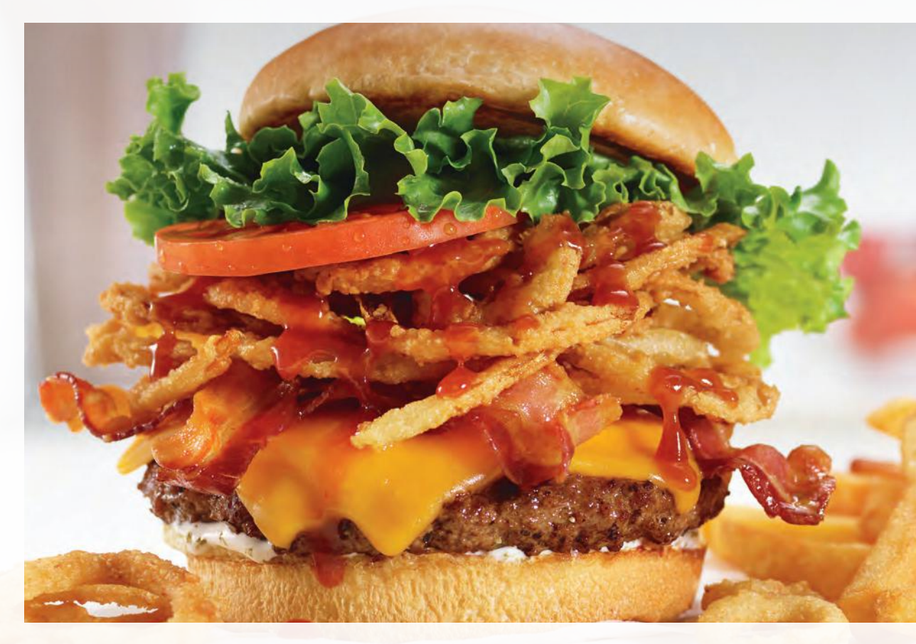
Honey BBQ Burger

Friendly's Big Beef® Burgers 100% USDA Choice 6 oz. burgers.