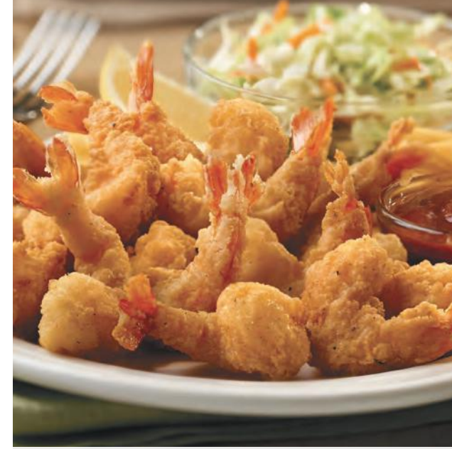
Fried Shrimp Platter