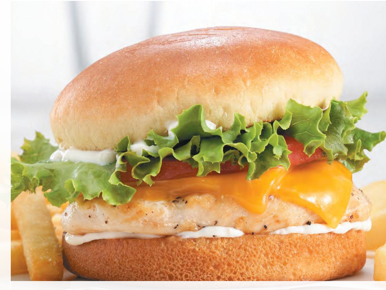
Grilled Chicken Sandwich