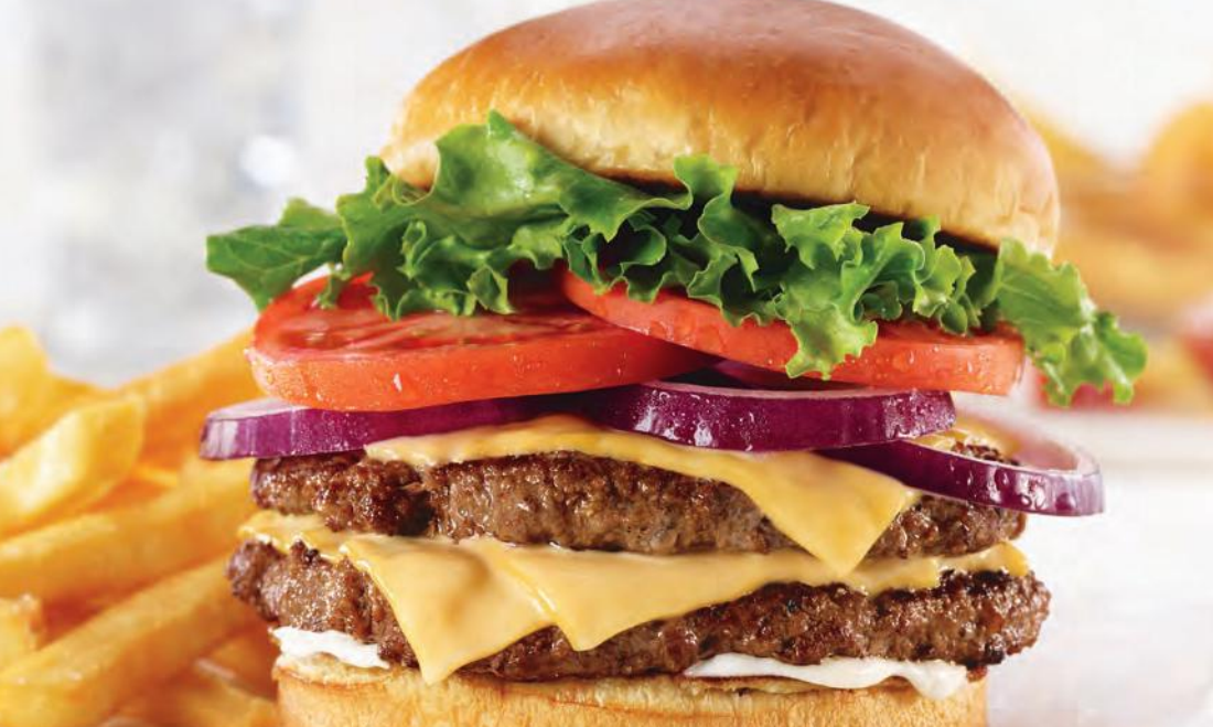
DOUBLE All-American Cheeseburger