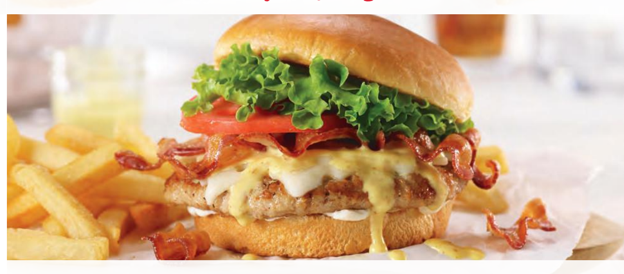
Bacon & Swiss Turkey Burger