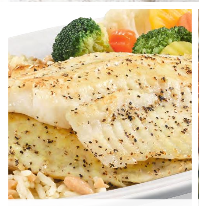
Lemon Pepper Fish Dinner

New England Fish 'N' Chips 13.49 Flaky tavern-battered premium cod fillets served with golden fries, coleslaw, a lemon wedge and tartar sauce. (1300 Calories)