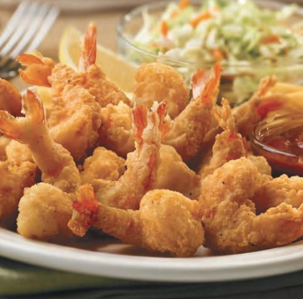
Fried Shrimp Platter