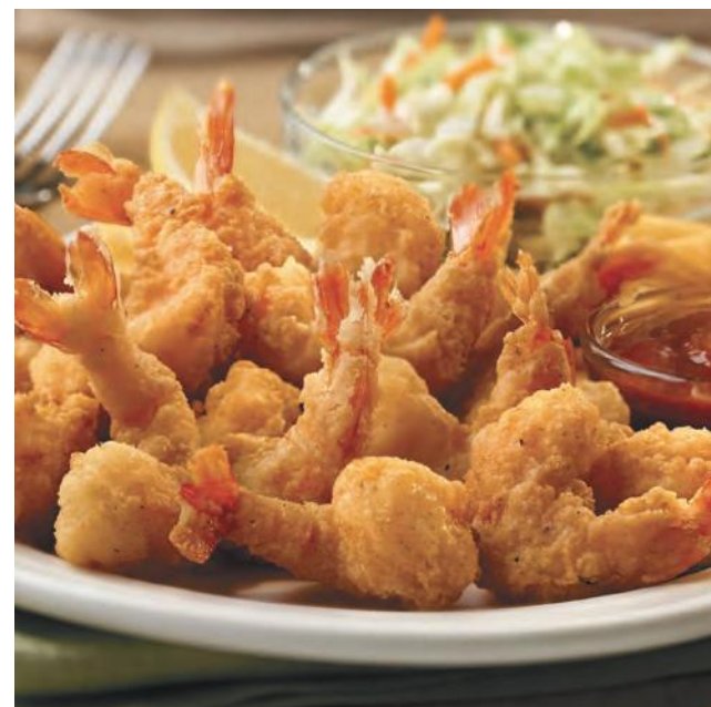
Fried Shrimp Platter