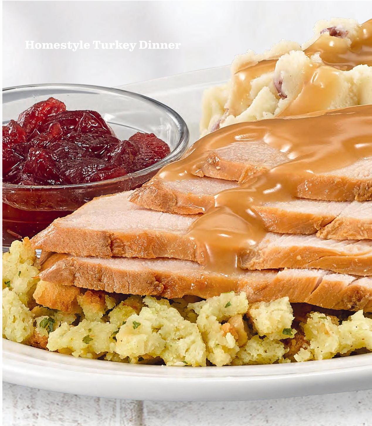
Homestyle Turkey Dinner

Flaky tavern-battered premium cod fillets served with golden fries, coleslaw, a lemon wedge and tartar sauce. (1300 Calories)