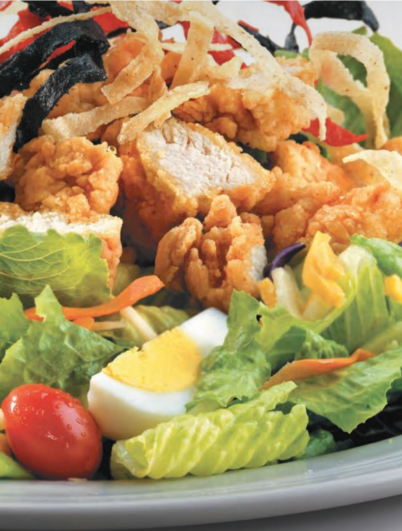
Signature Chicken Entree Salad

Flavor-packed salads that make you feel as good as they taste.