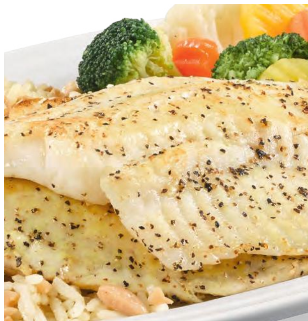
Lemon Pepper Fish Dinner