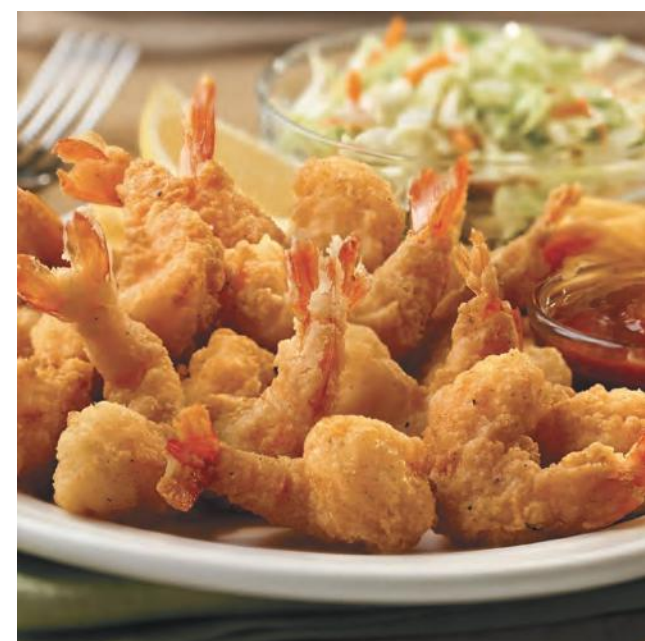
Fried Shrimp Platter