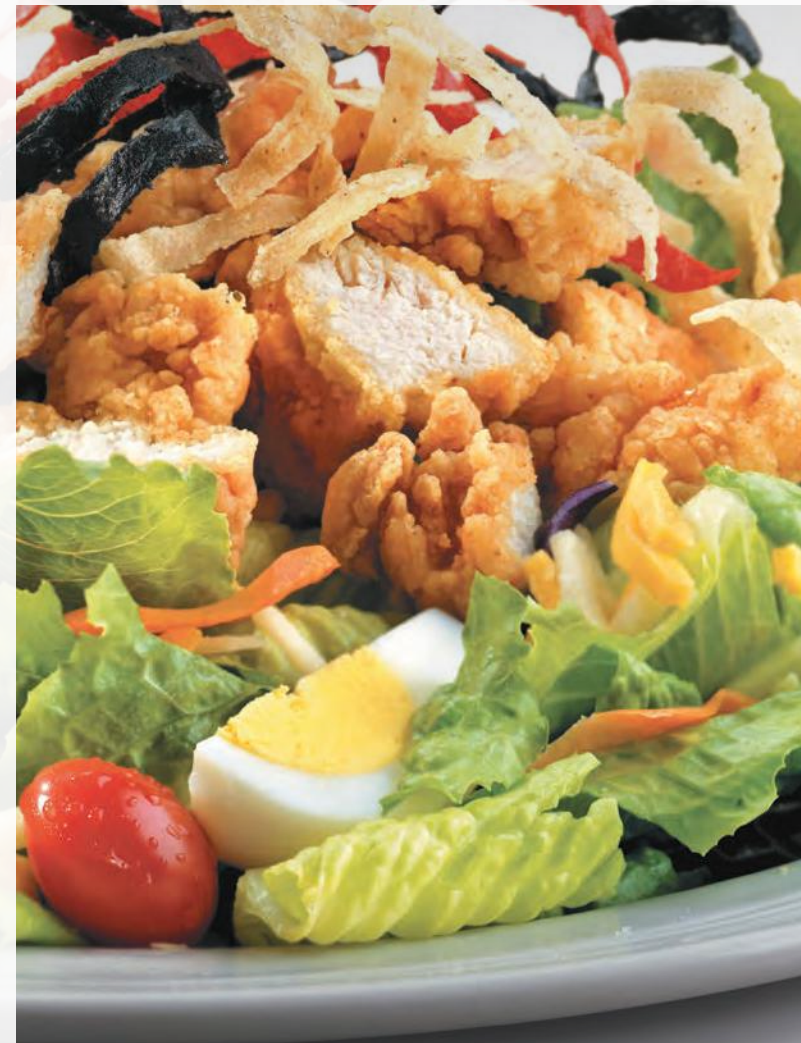
Signature Chicken Entree Salad