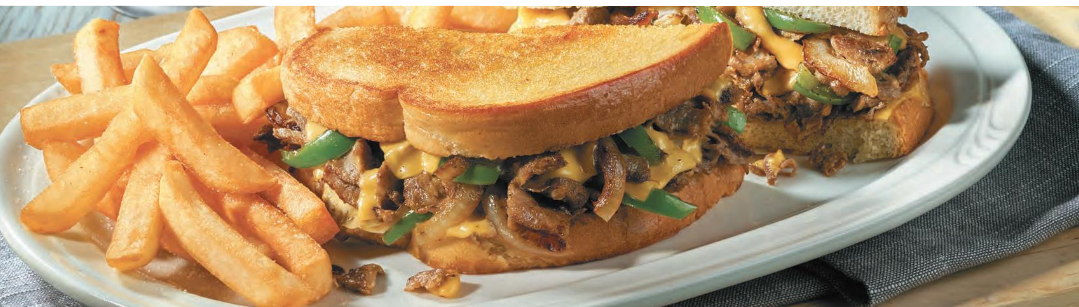
Philly Steak & Cheese SuperMelt

It's our commitment to mixing & melting fun flavors to make your Friendly's favorites the best part of your day.