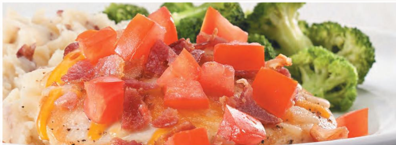
NEW Cheddar Jack Chicken