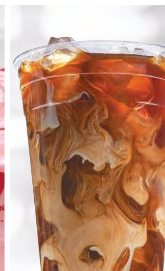
NEW Iced Coffee