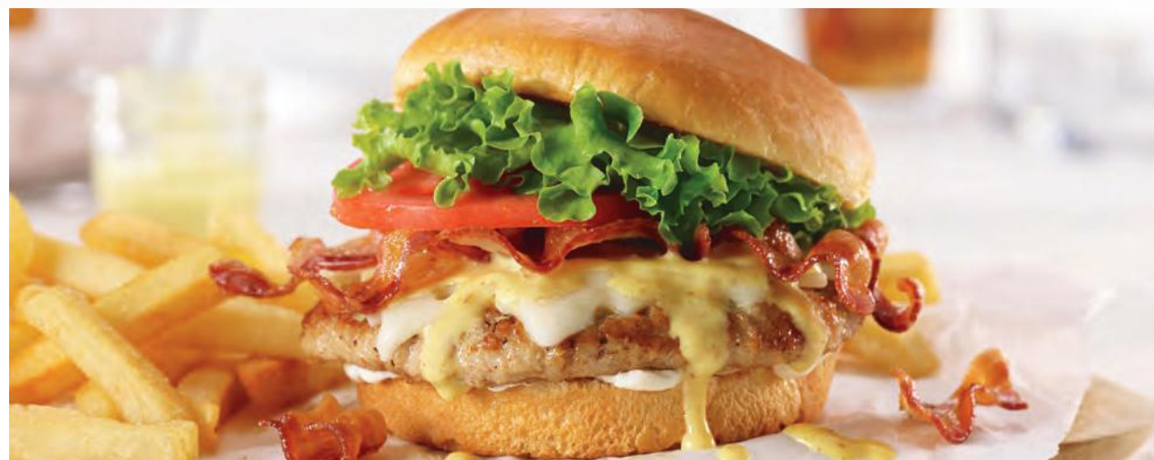
Bacon & Swiss Turkey Burger