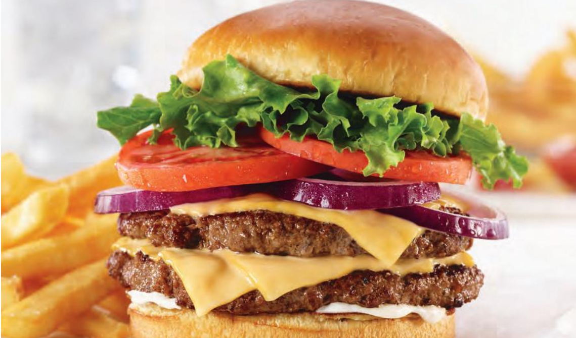
DOUBLE All-American Cheeseburger

Sweet, sweet bliss when you bite into two 4.75 oz. burger patties topped with our signature honey BBQ sauce, melted Cheddar cheese, crispy fried onion strings, applewood-smoked bacon, fresh lettuce, tomato and Ranch dressing on a soft Brioche bun. (1760 Calories)