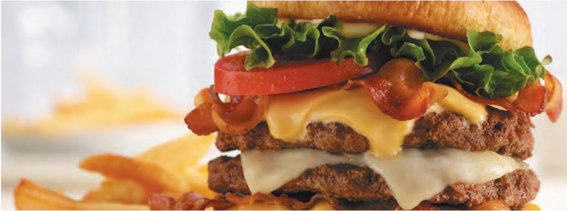
NEW Triple Decker Bacon Cheeseburger

Three stories of thick beef patties covered with gooey melted Swiss, American and Cheddar cheeses, four strips of bacon, lettuce, tomato and mayo served up with golden fries. It's 14.25 ozs of pure deliciousness. (1760 Calories)