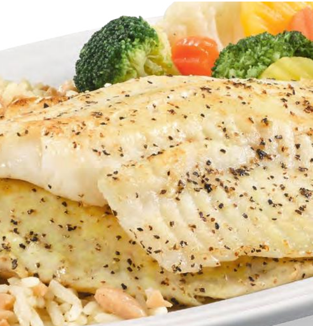
Lemon Pepper Fish Dinner