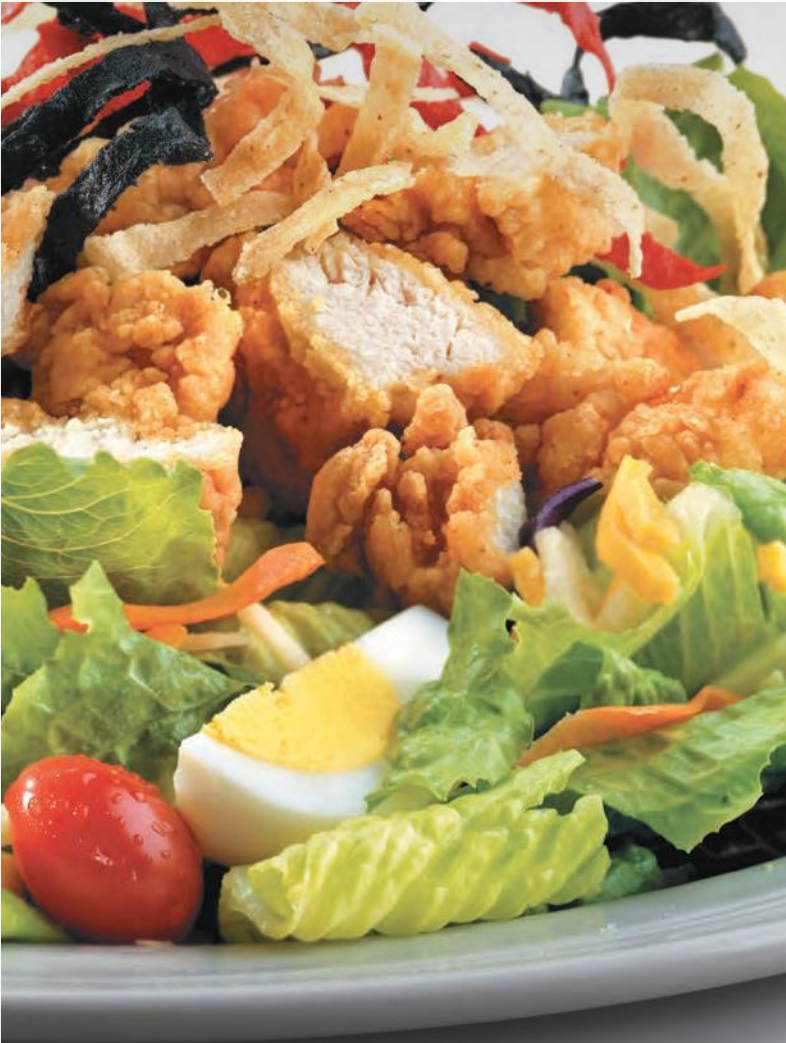
Signature Chicken Entree Salad