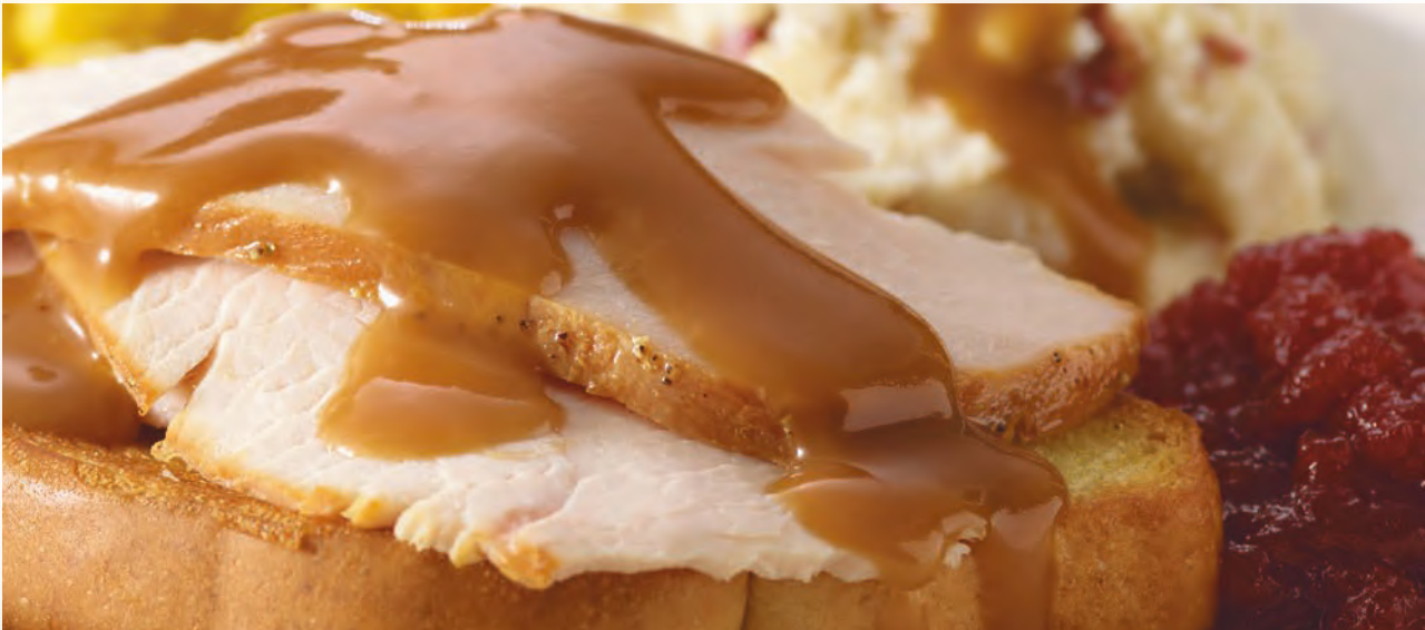
Open-Faced Turkey Sandwich