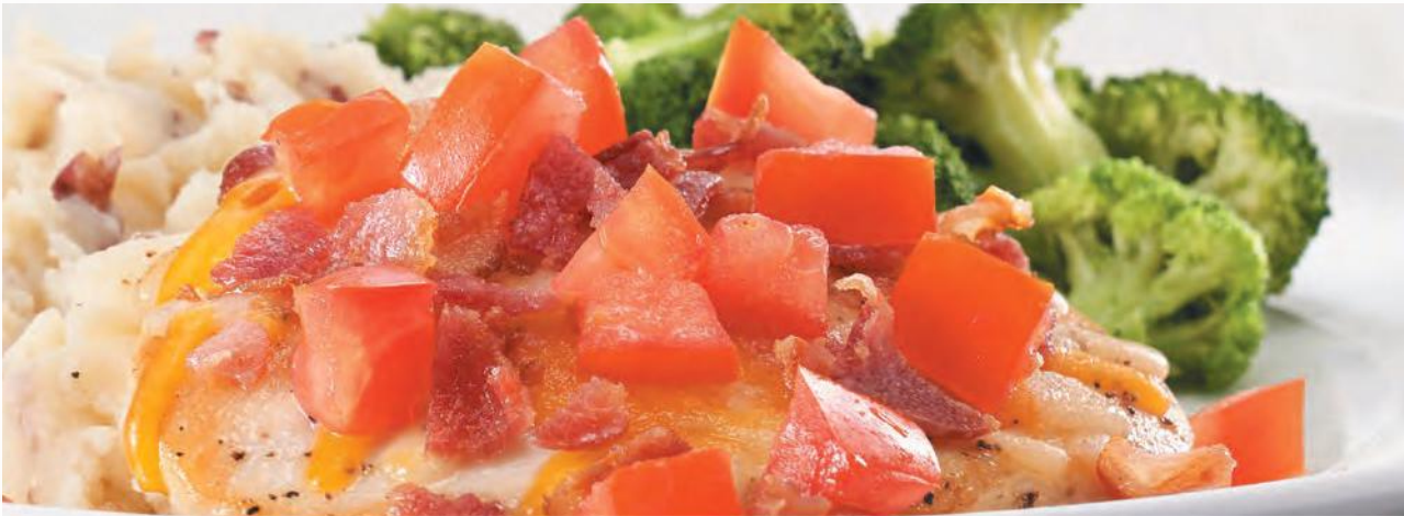
NEW Cheddar Jack Chicken