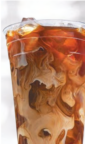
NEW Iced Coffee