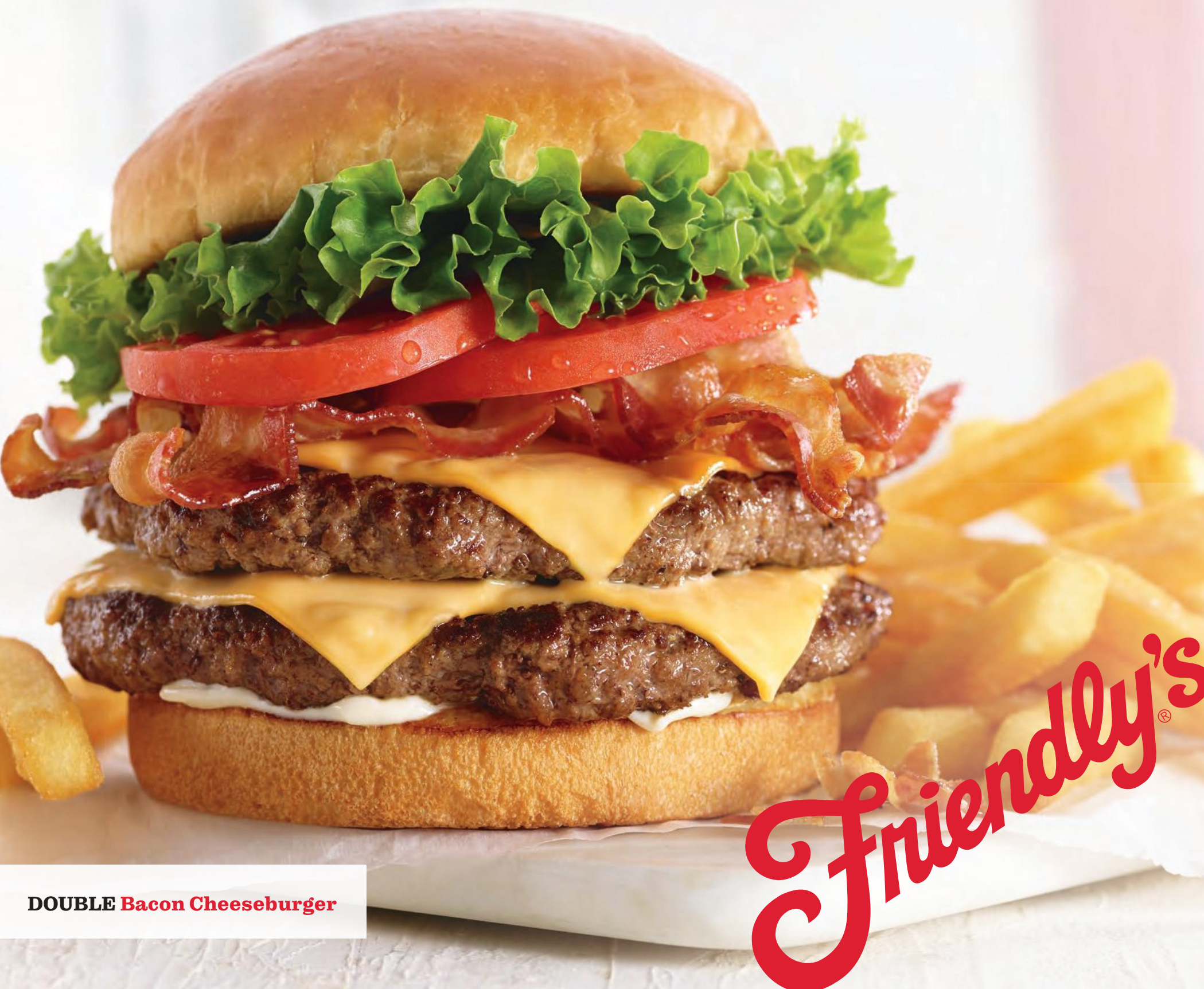
DOUBLE Bacon Cheeseburger