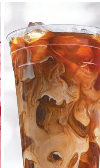
NEW Iced Coffee