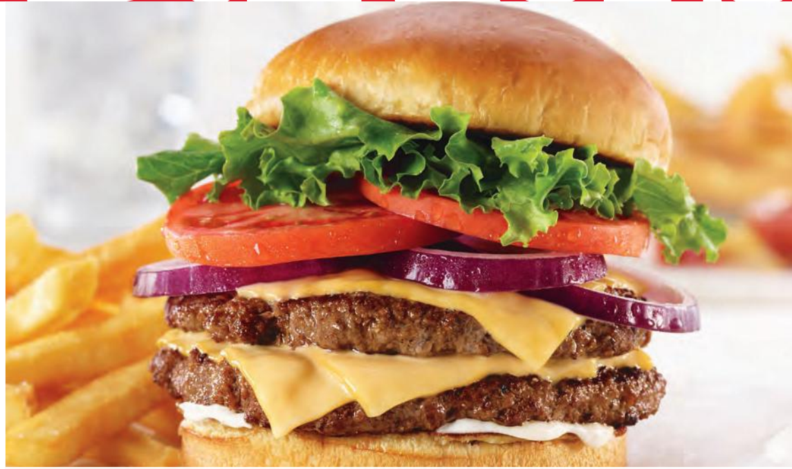
DOUBLE All-American Cheeseburger

Sweet, sweet bliss when you bite into two 4.75 oz. burger patties topped with our signature honey BBQ sauce, melted Cheddar cheese, crispy fried onion strings, applewood-smoked bacon, fresh lettuce, tomato and Ranch dressing on a soft Brioche bun. (1760 Calories)